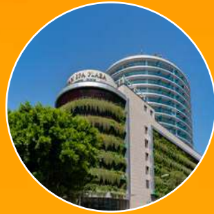
OCEAN SPA PLAZA