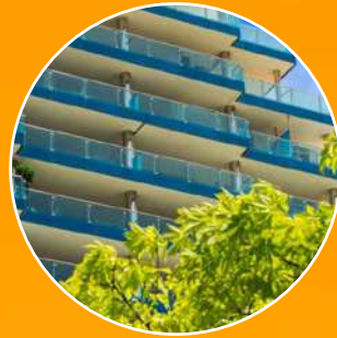
GRAND OCEAN PLAZA