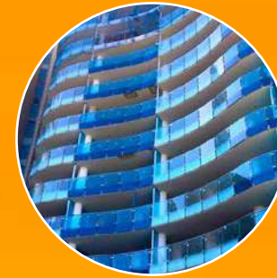
IMPERIAL OCEAN PLAZA