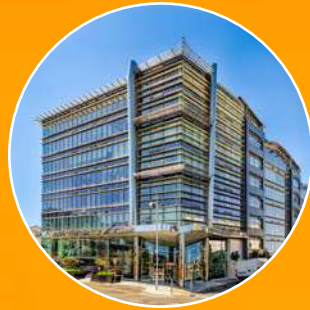
WORLD TRADE CENTER GIBRALTAR