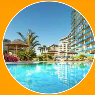
ROYAL OCEAN PLAZA