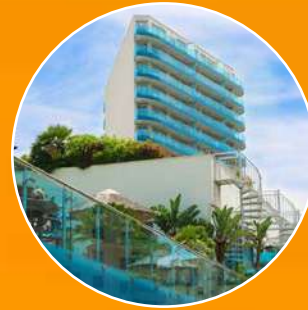
MAJESTIC OCEAN PLAZA