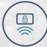
Contactless access to communal areas