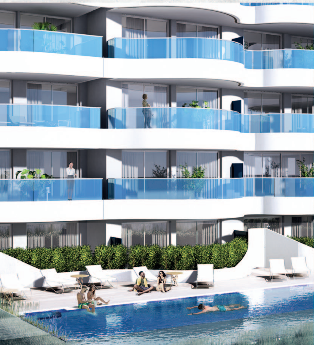
POOL FOR ADULTS

EXCLUSIVE SERVICES FOR THE MOST DEMANDING