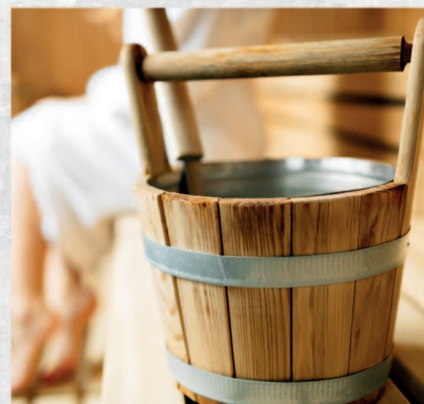
SPA & SAUNA