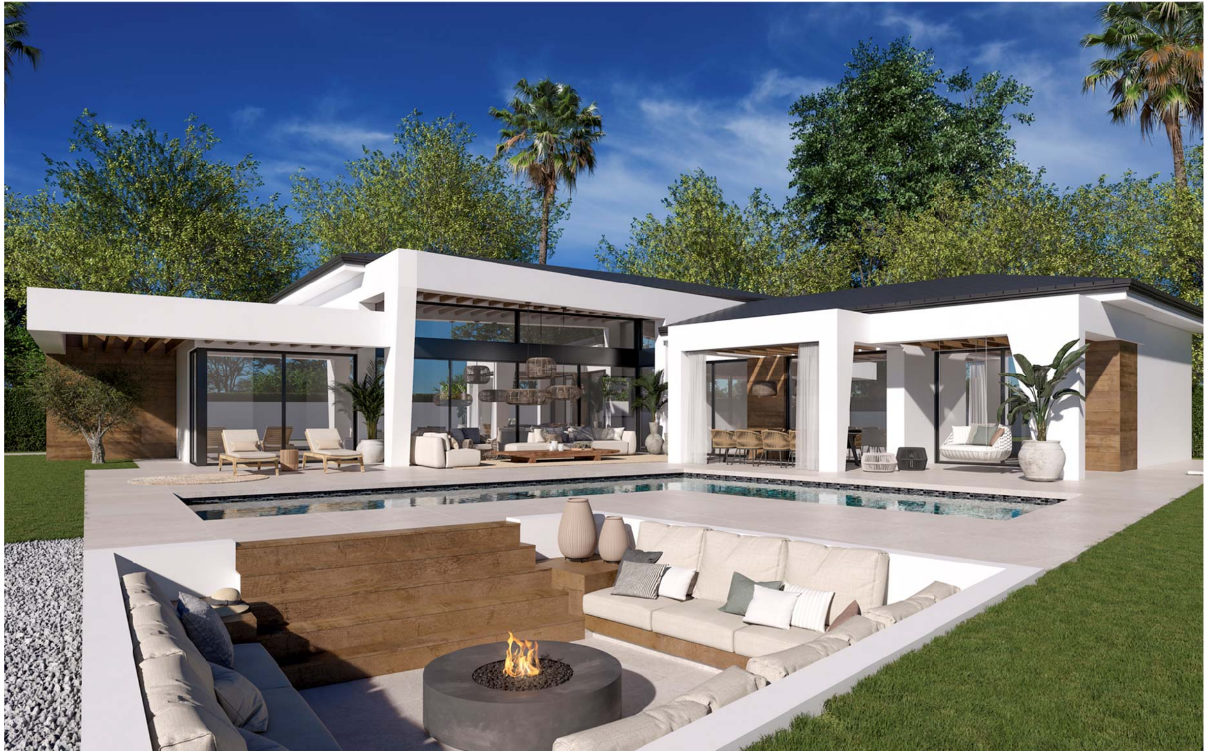
Non-binding figurative image