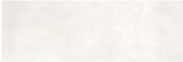
Porcelanic tile 30x90 Boreal blanco