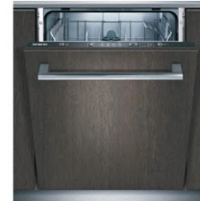
Induction hob, fridge/freezer, microwave, oven and dishwasher siemens / Washing machine & dryer