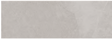
Porcelanic tile 30x90 Mixit blanco