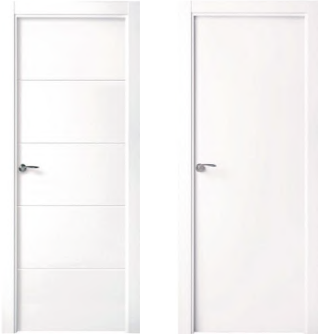
Internal doors. 2,10m height, with hidden hinges