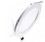
LED spot light