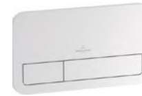
Pulsador villeroy & boch E200 blanco