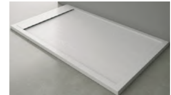
White resine shower tray

* If there is no availability of the materials shown here, they will be replaced with a similar one.