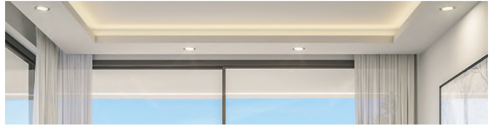
LED spot light & cove lighting