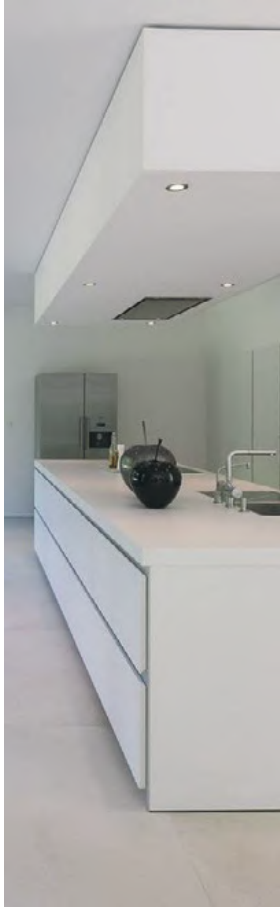
Finger pull white matt/gloss doors