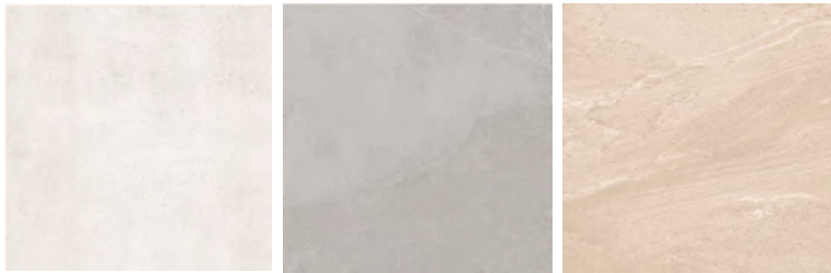
Antislip Porcelanic tile