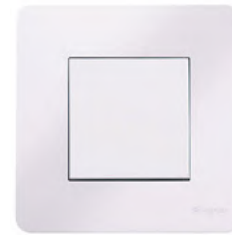
New Unica Schneider electrics