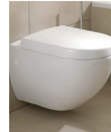
Villeroy & Boch Subway 2,0