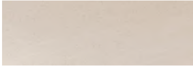
Porcelanic tile 30x90 Brancato beige