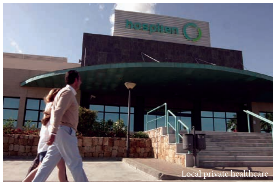
Local private healthcare