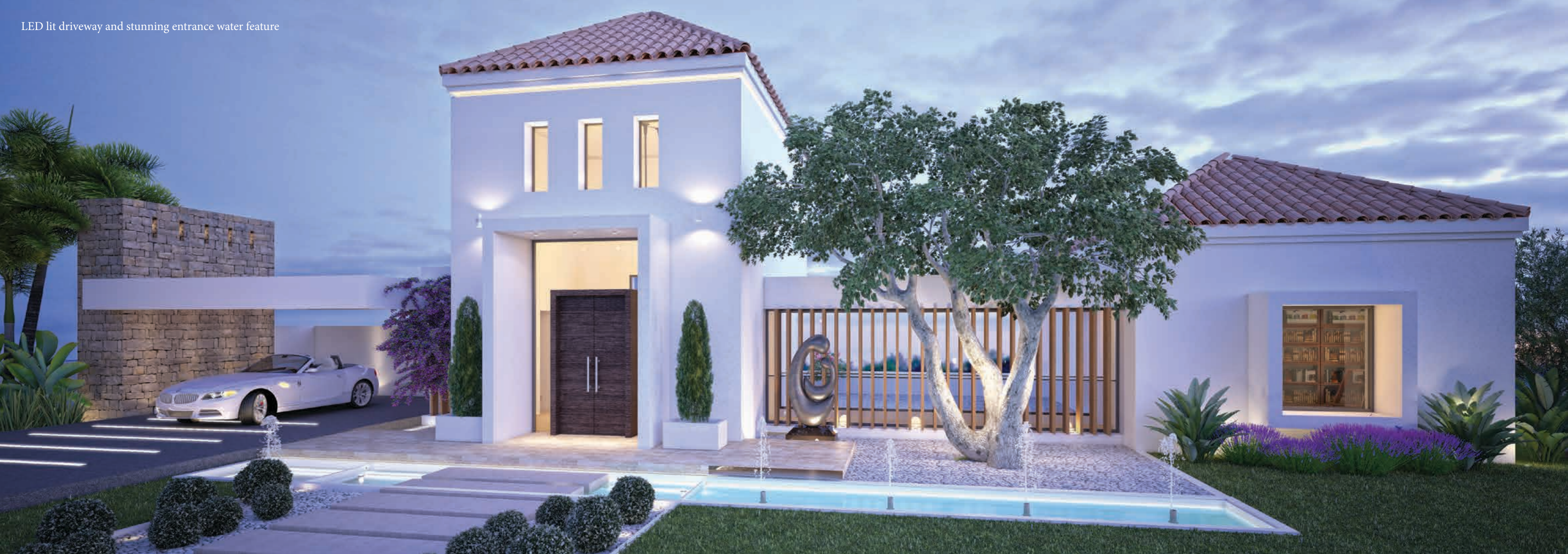
LED lit driveway and stunning entrance water feature