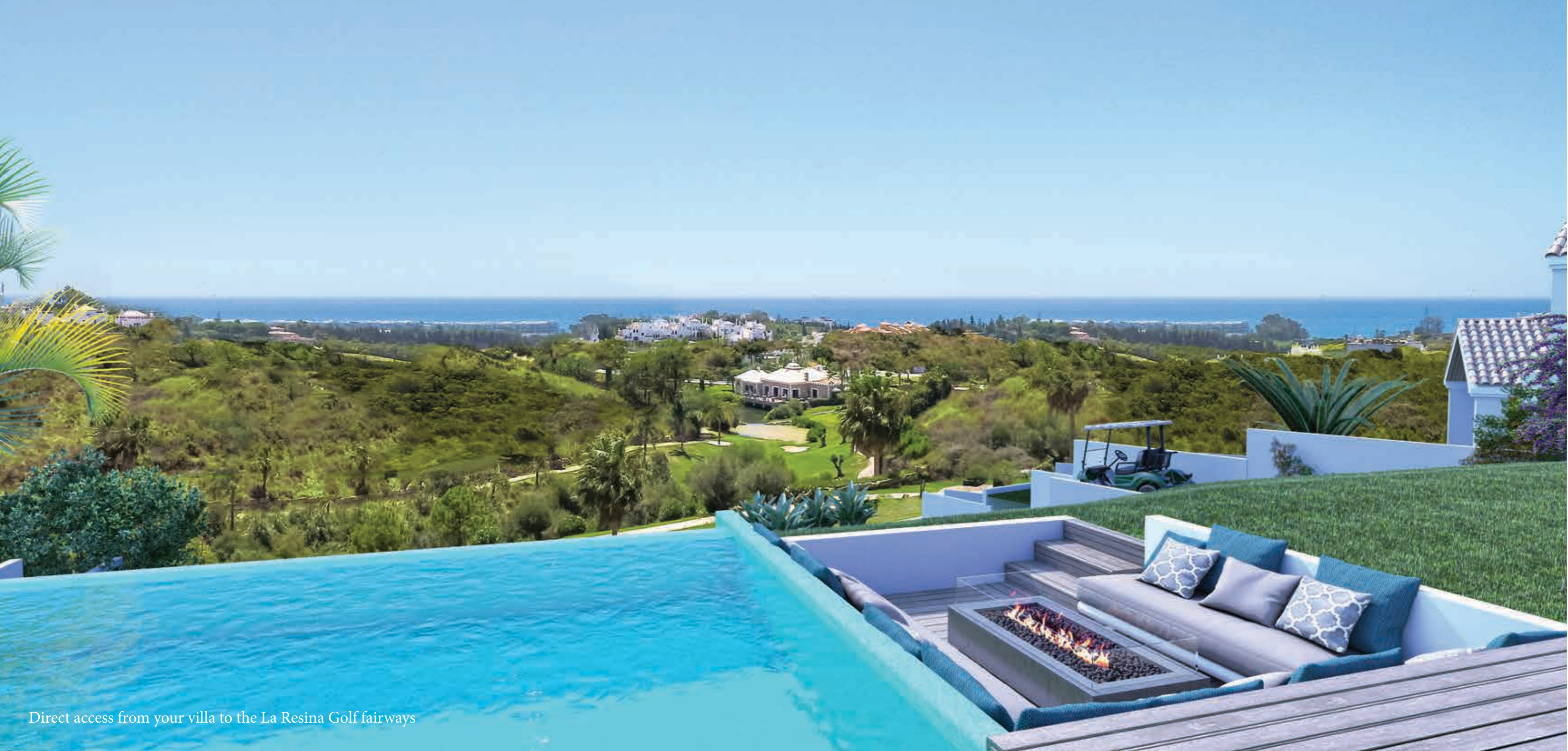
Direct access from your villa to the La Resina Golf fairways