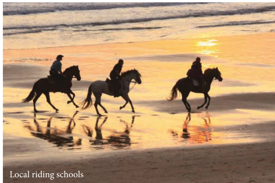
Local riding schools