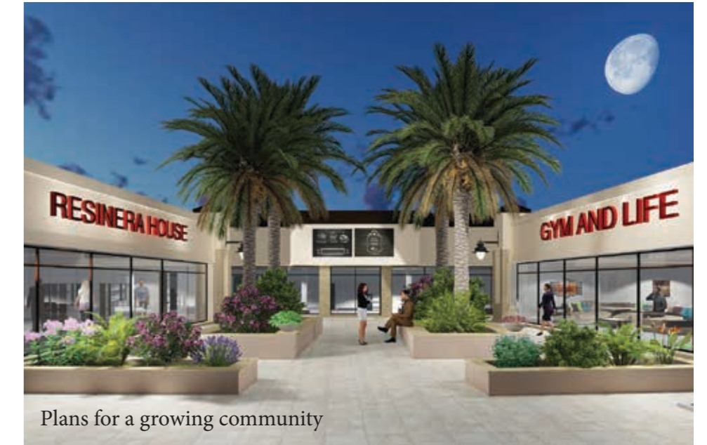
Plans for a growing community