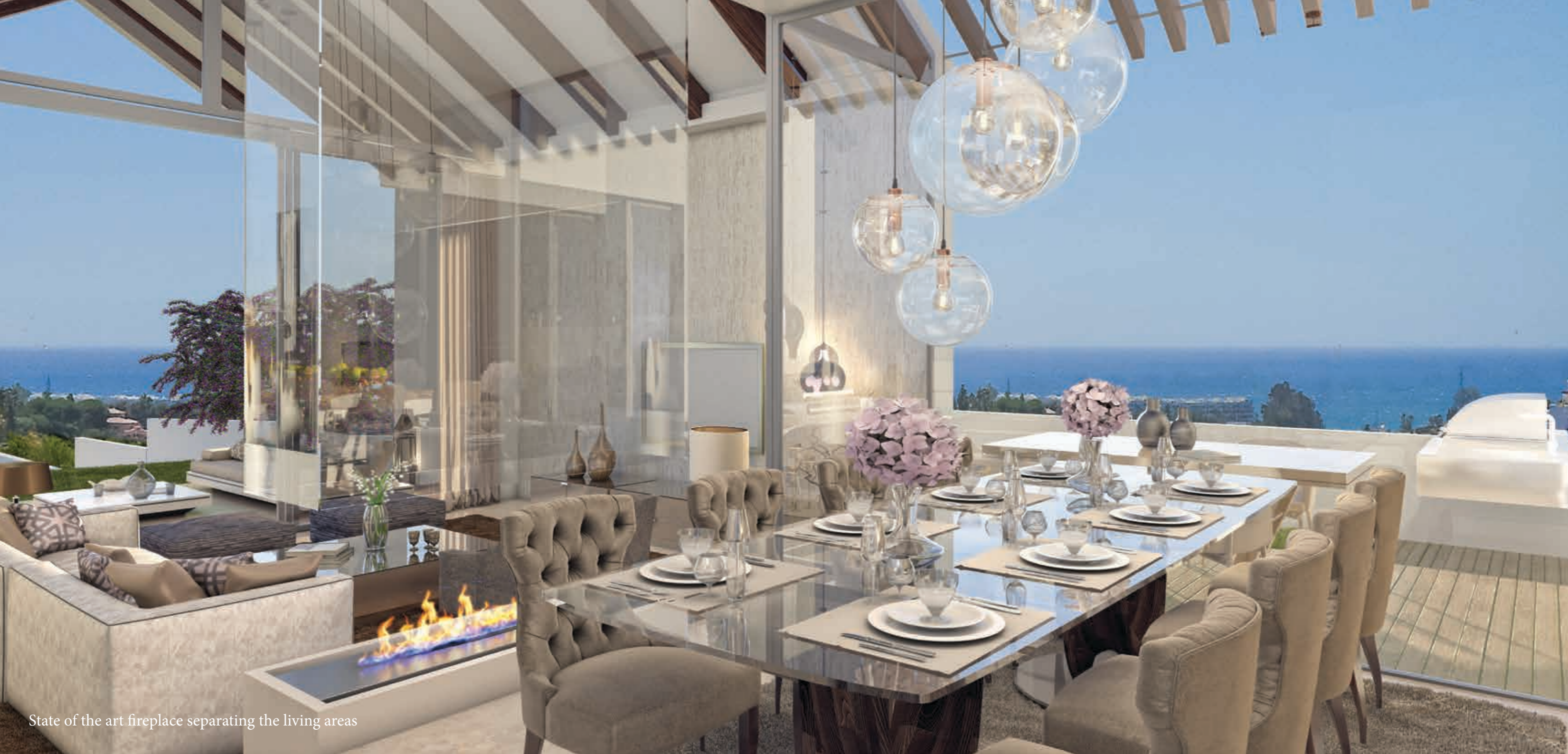
State of the art fireplace separating the living areas