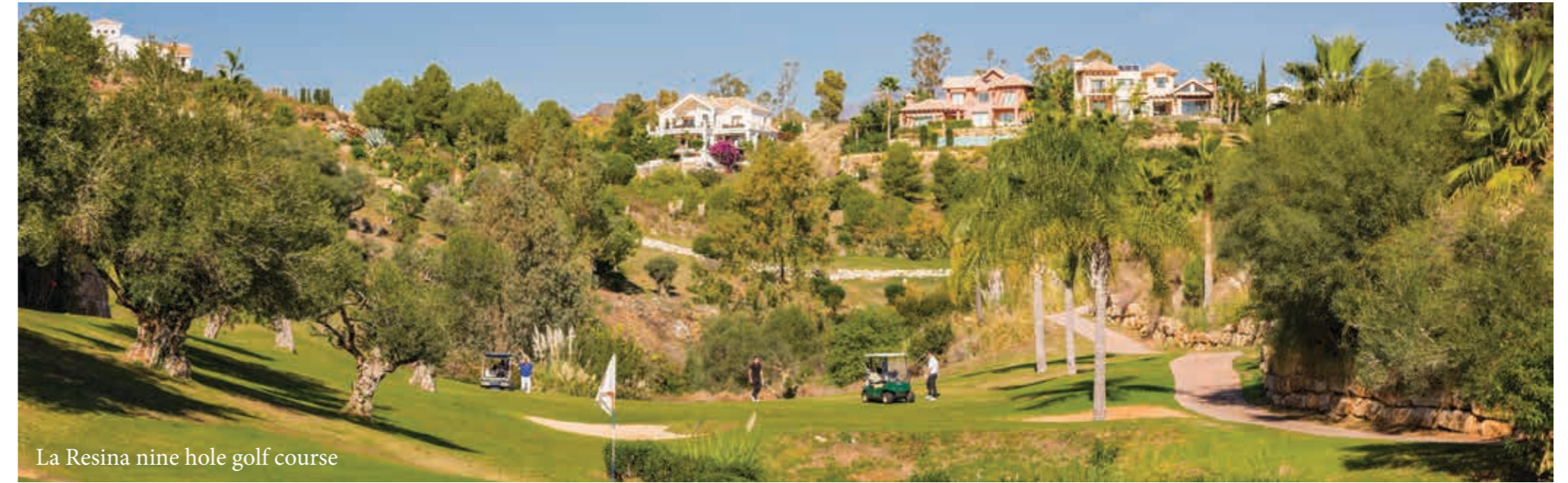
La Resina nine hole golf course