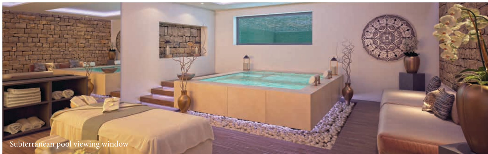
Subterranean pool viewing window