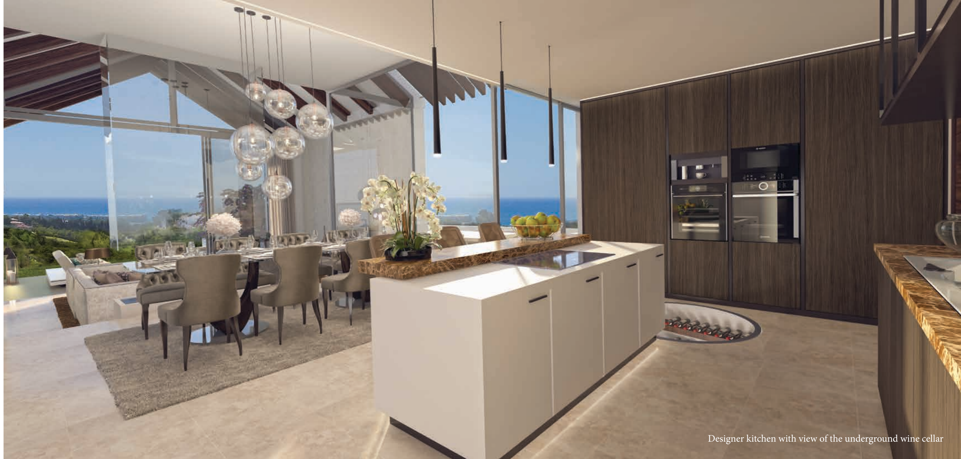
Designer kitchen with view of the underground wine cellar

Natural light will flood every corner of your home with the creative use of glass walls and room dividers.