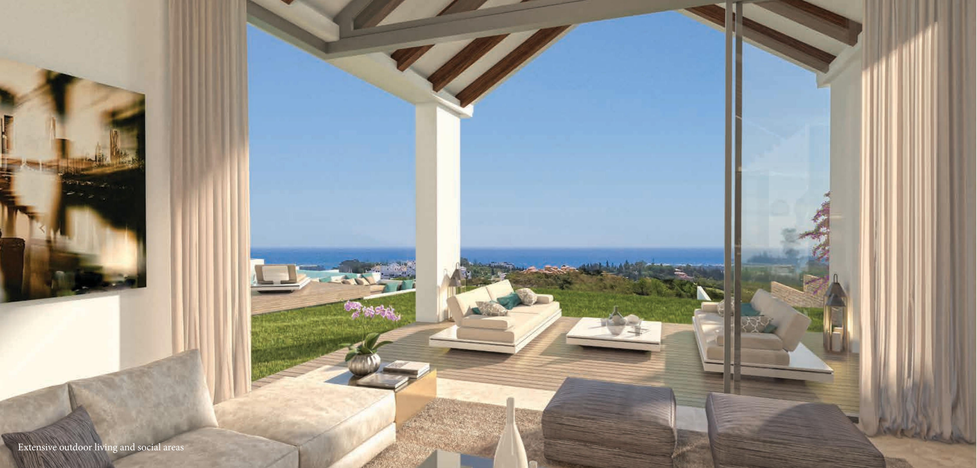
Extensive outdoor living and social areas