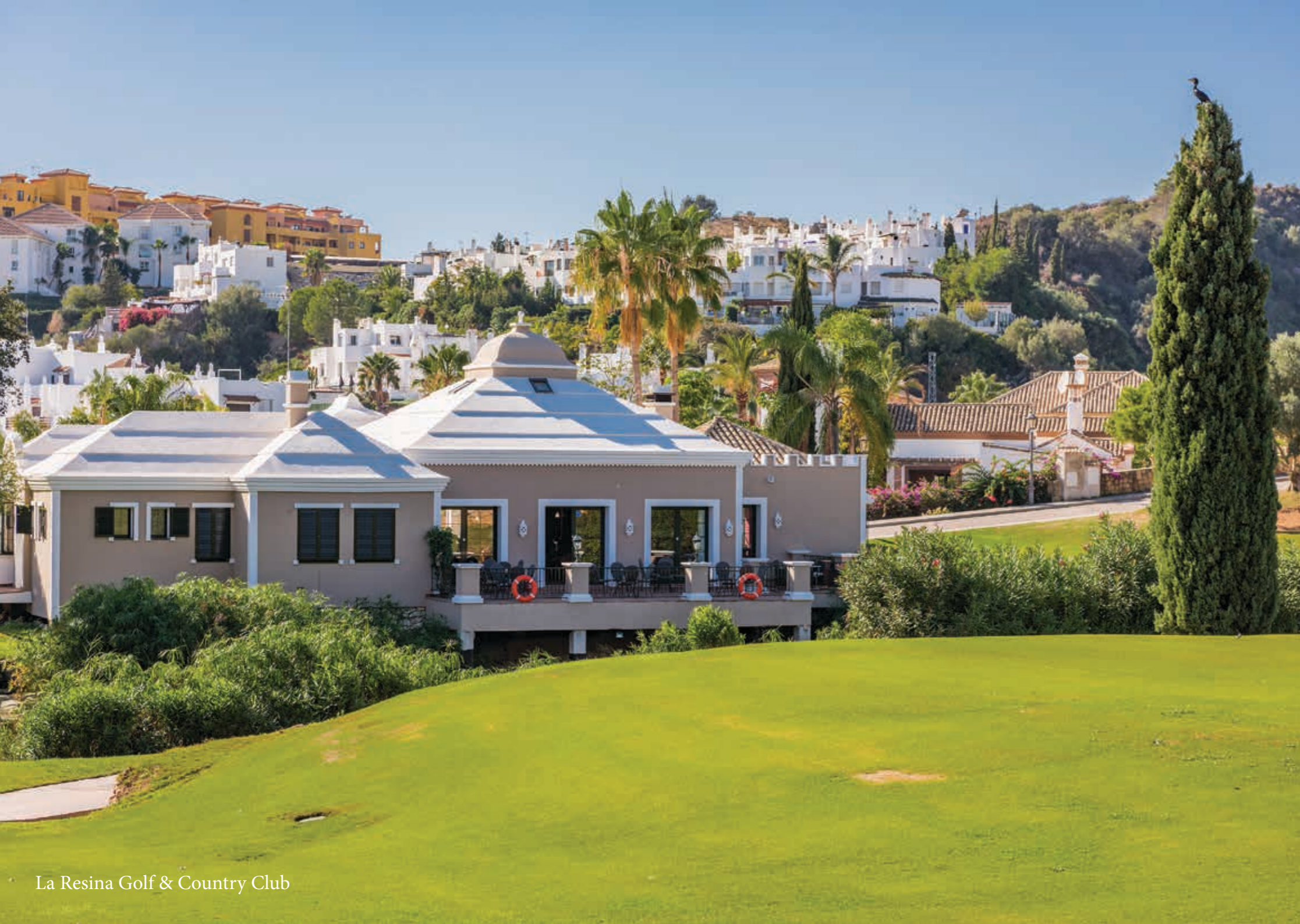
La Resina Golf & Country Club