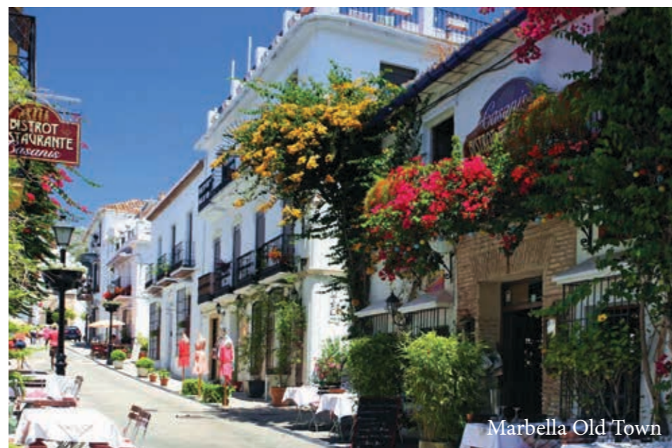
Marbella Old Town