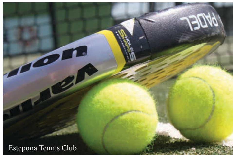
Estepona Tennis Club