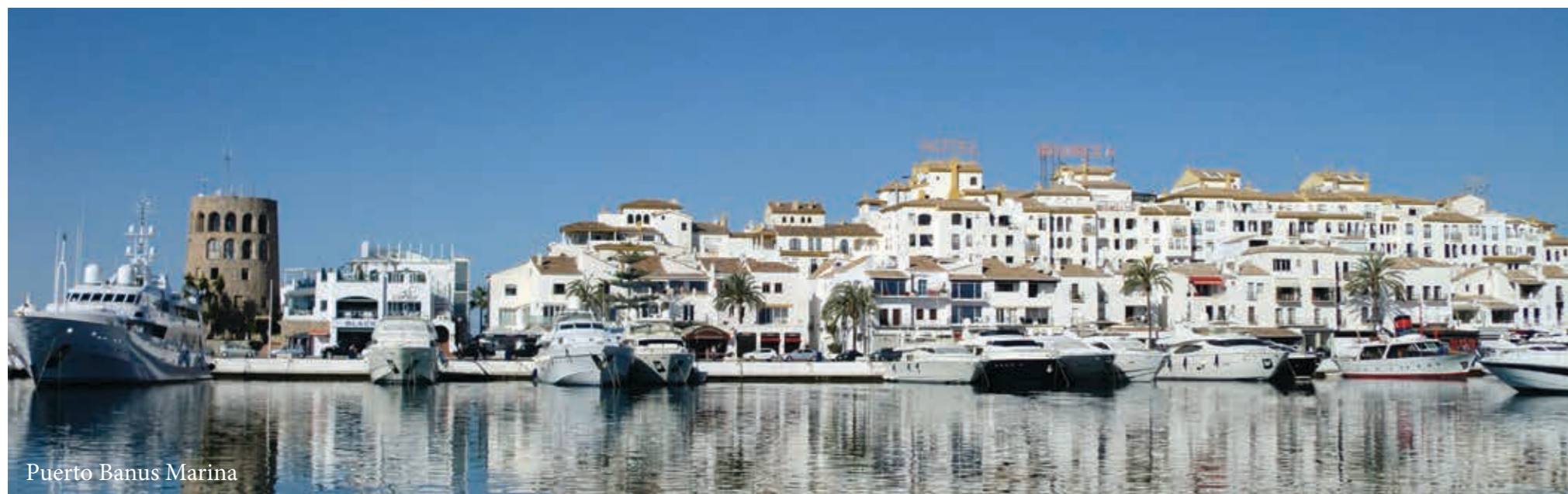
Puerto Banus Marina