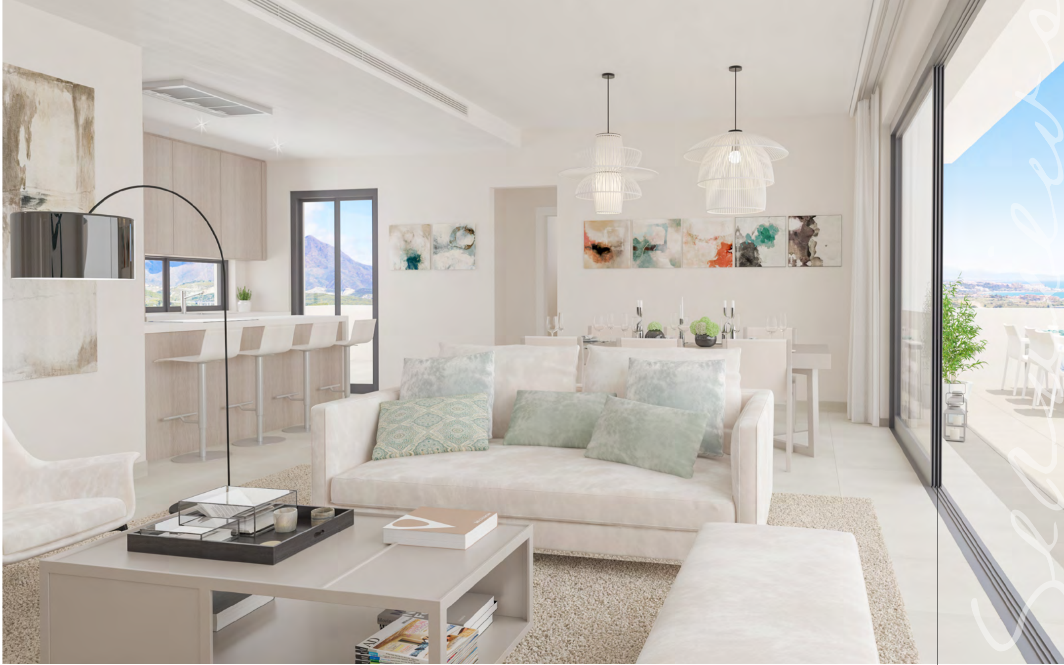
ALUMINIUM FRAMES WITH REDUCED PROFILE