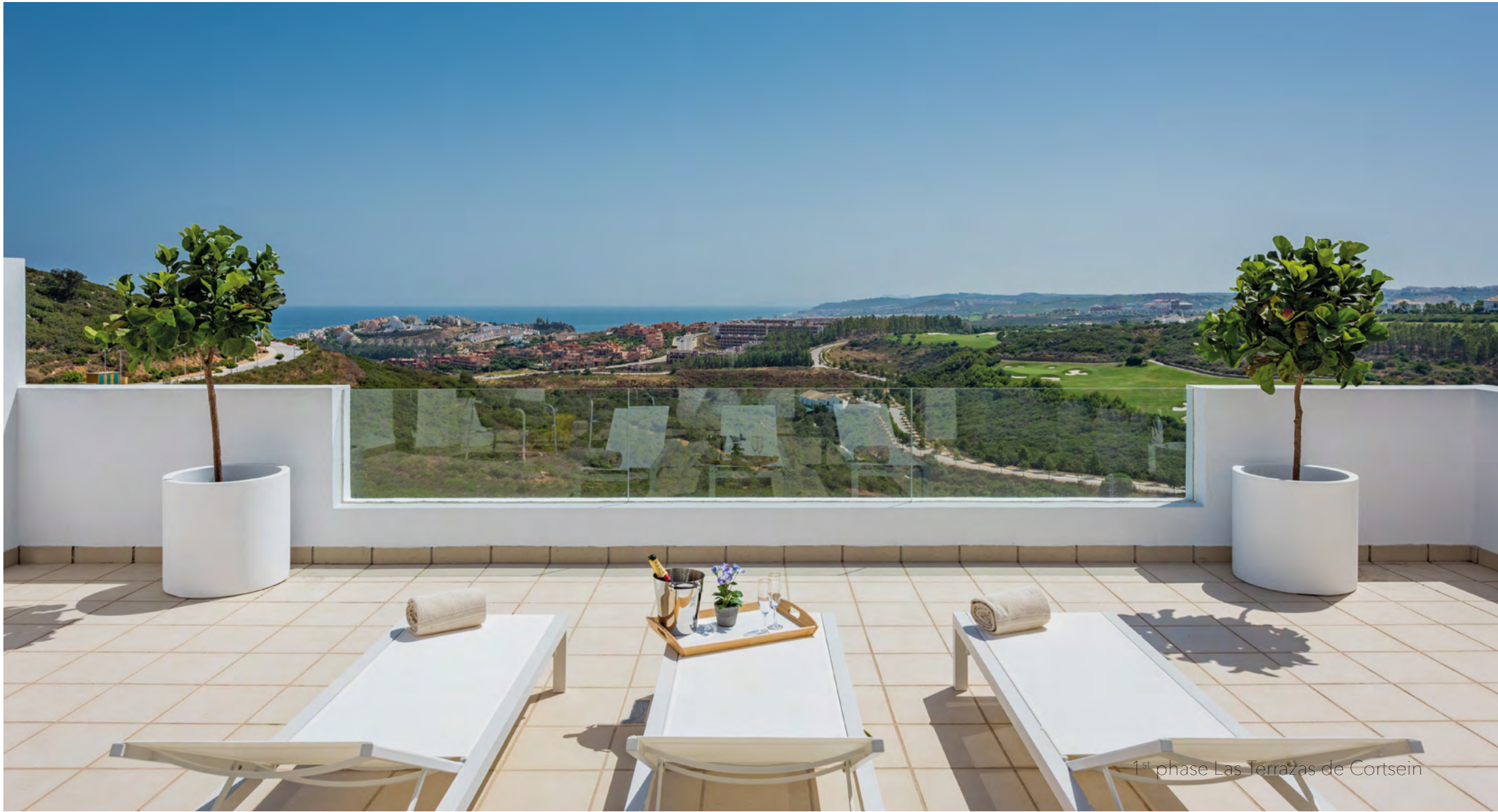
1 st phase Las Terrazas de Cortsein