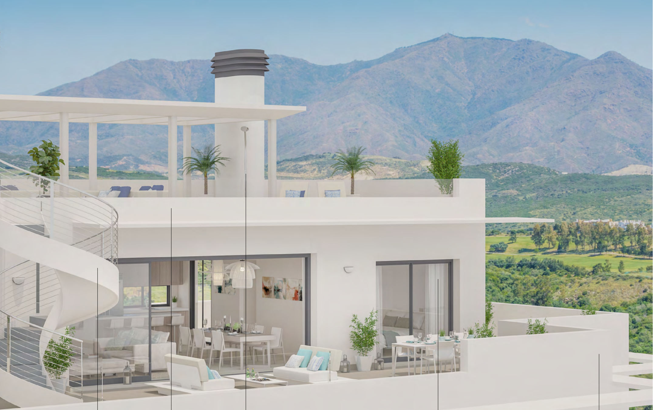
DESIGNER SPIRAL STAIRCASE