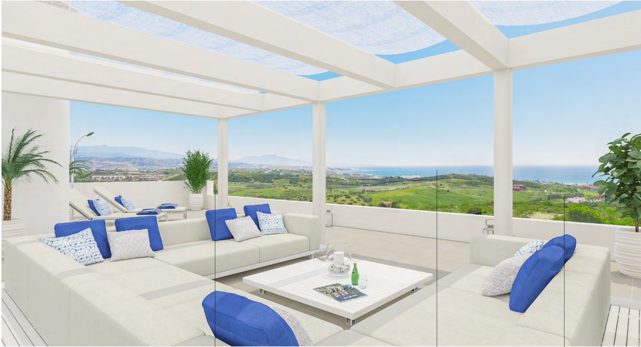
SOUTH AND SOUTHEAST ORIENTATION