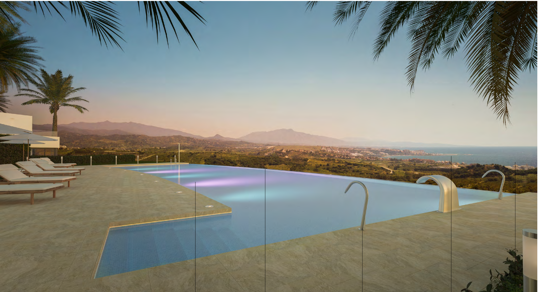
NIGHT WITH LED RGB LIGHTING