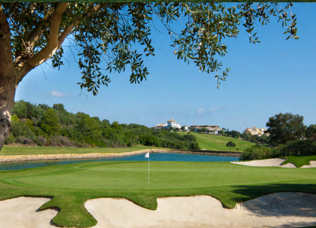
La Reserva Club