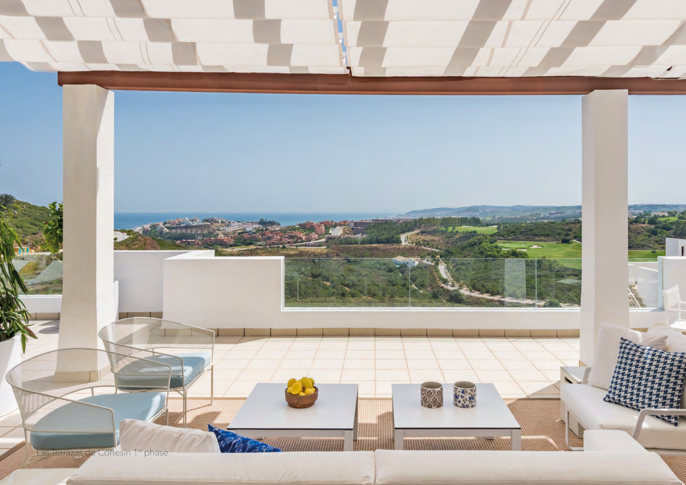
Las Terrazas de Cortesín 1 st phase