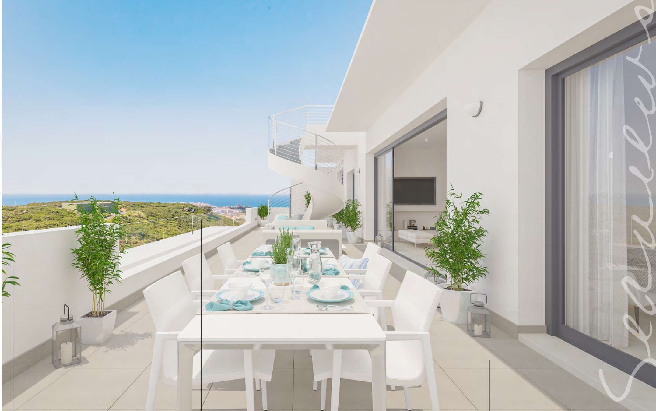
SOUTH AND SOUTHEAST ORIENTATION