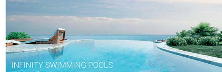
INFINITY SWIMMING POOLS