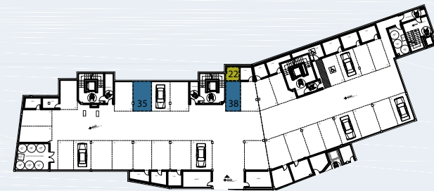
GARAGE AND STORAGE LOCATION (LEVEL +29,25M)