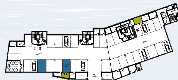
GARAGE AND STORAGE LOCATION (LEVEL +29,25M)