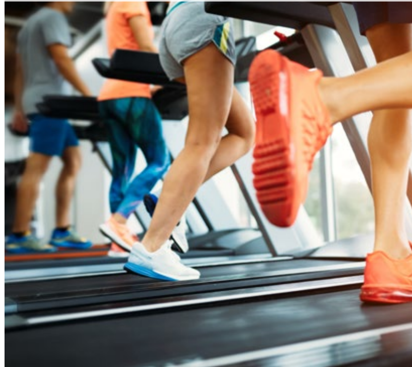
FULLY EQUIPPED GYMNASIUM