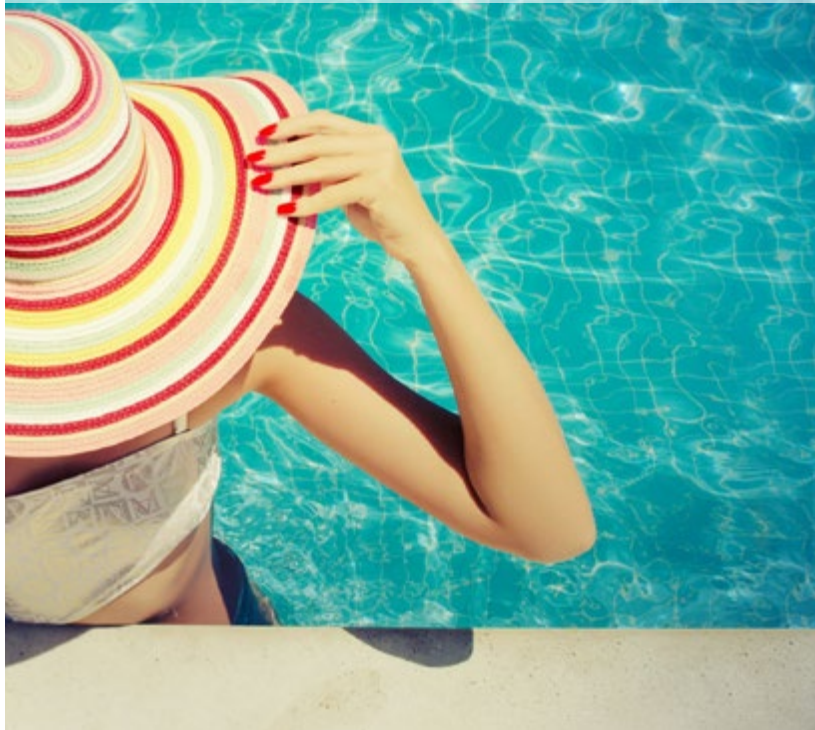
LAGOON SHAPPED POOLS