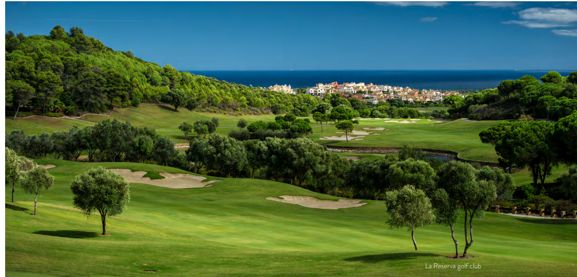
La Reserva golf club