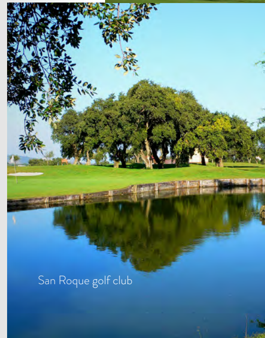
San Roque golf club

La Reserva Club in Sotogrande is just 5 minutes away and has many facilities on offer including the Golf Course, Horse Riding and the original 'The Beach', a fantastic resort beside the Golf Course which includes a restaurant, white sandy beach and lagoon for sports activities etc.