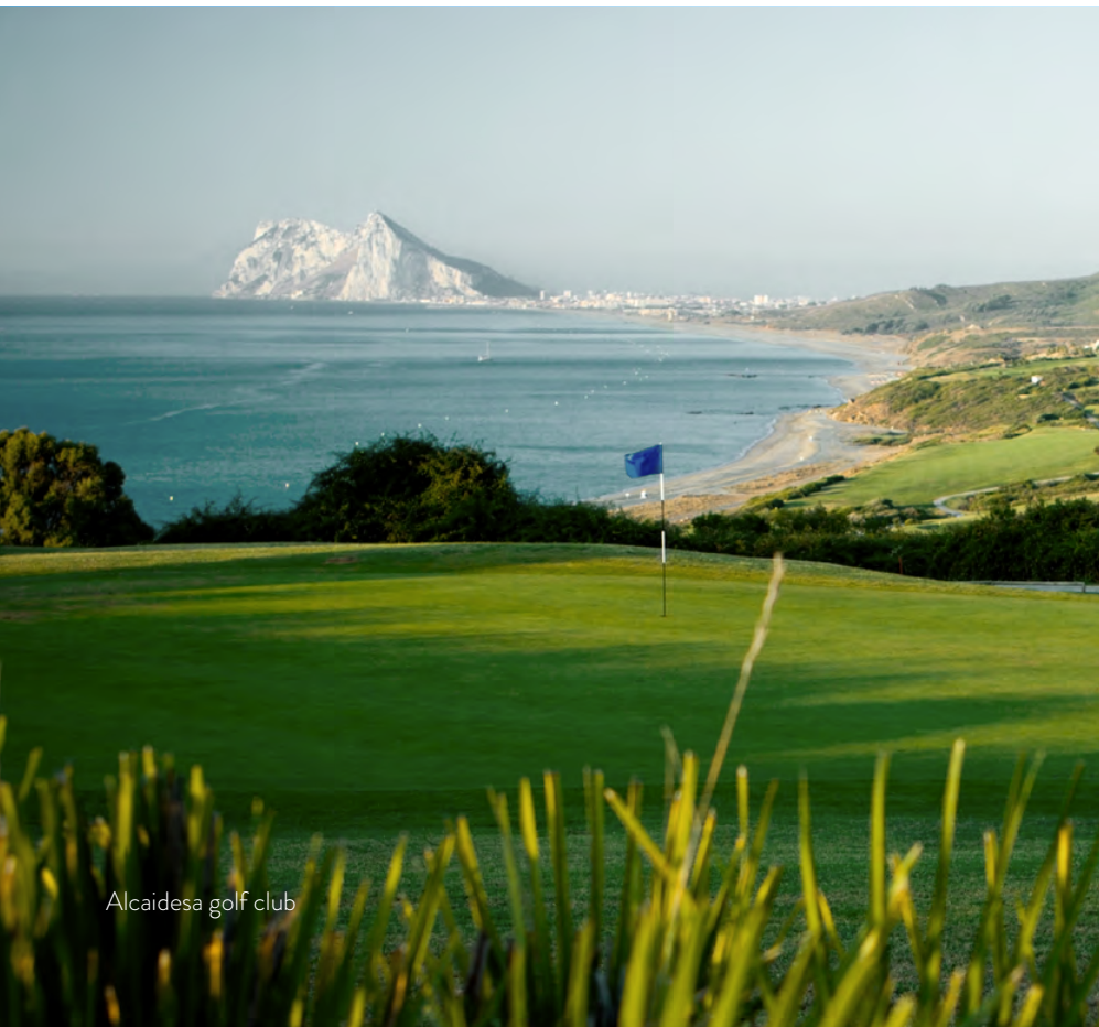
Alcaidesa golf club