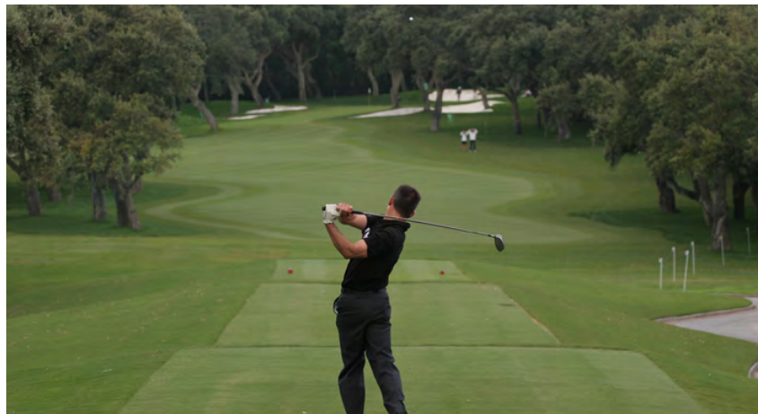
Real club de golf Valderrama