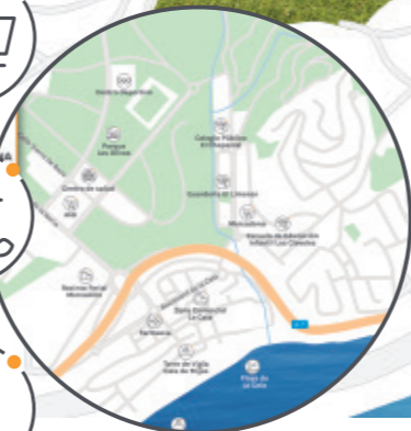
*Cala de Mijas 1.6km(3min)