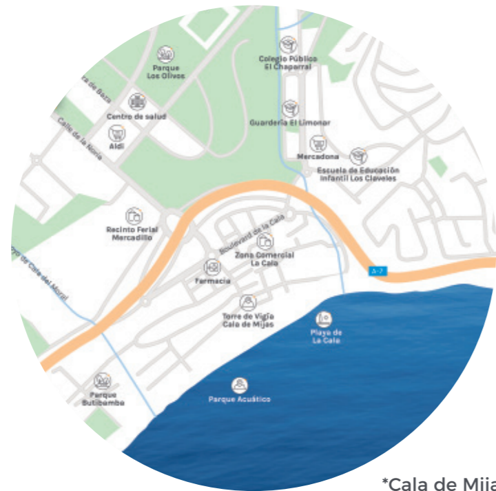
*Cala de Mijas

And just 30 minutes away are the airport and the city of Málaga.