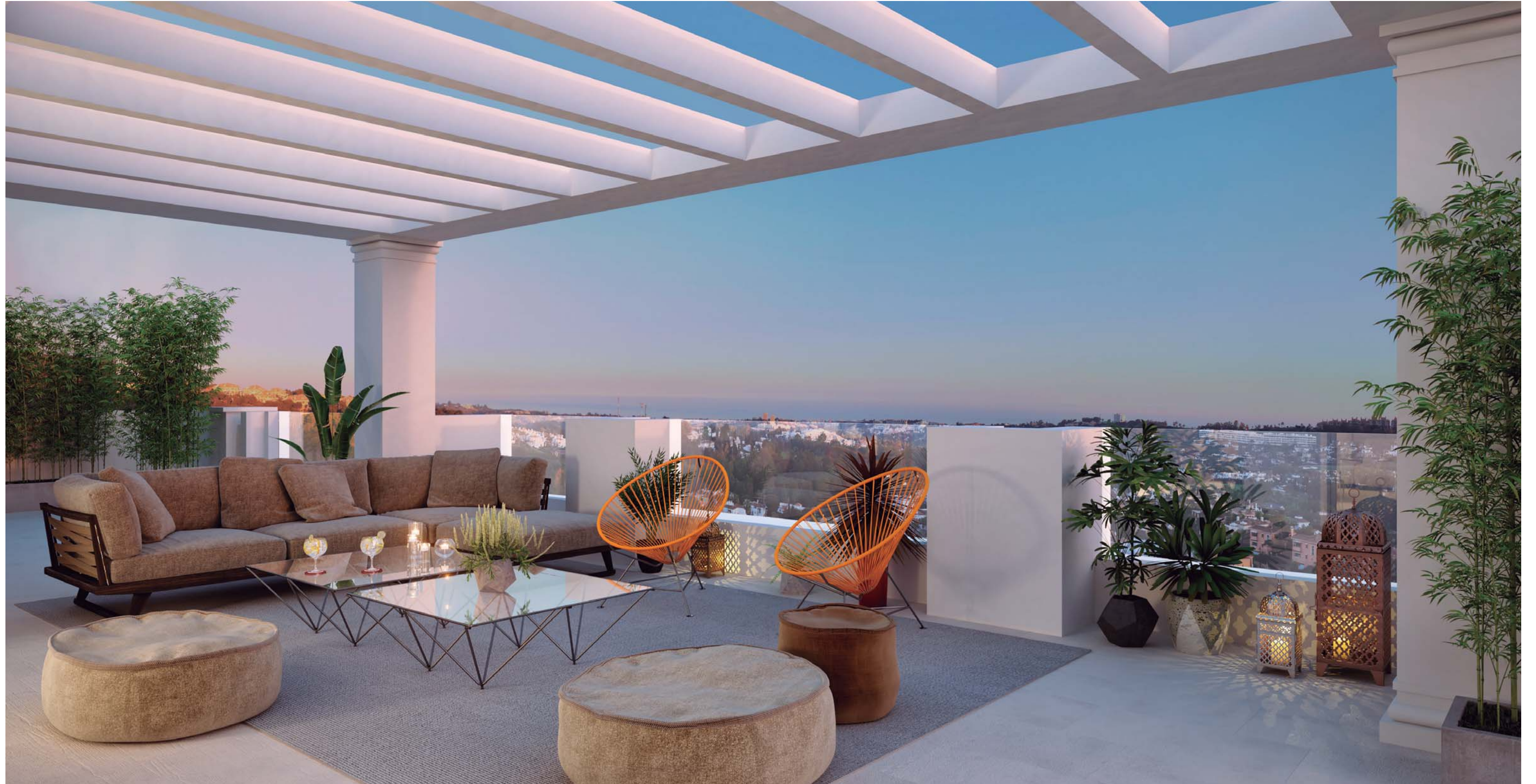
GENEROUS PRIVATE TERRACES INVITE SPENDING THE WARM SUMMER EVENINGS OUTSIDE