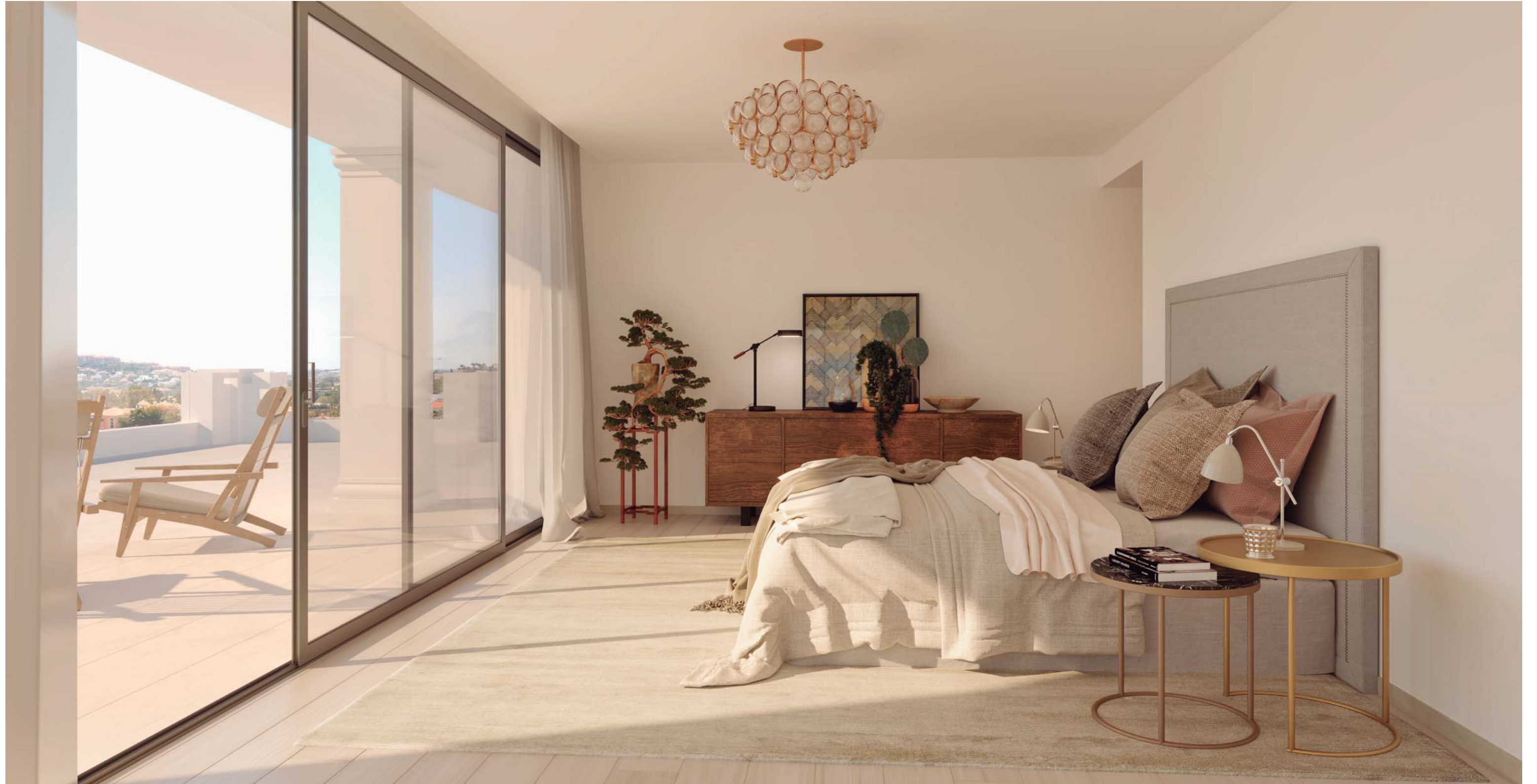
PENTHOUSE BEDROOMS WITH PRIVATE TERRACES OVERLOOKING PUERTO BANÚS