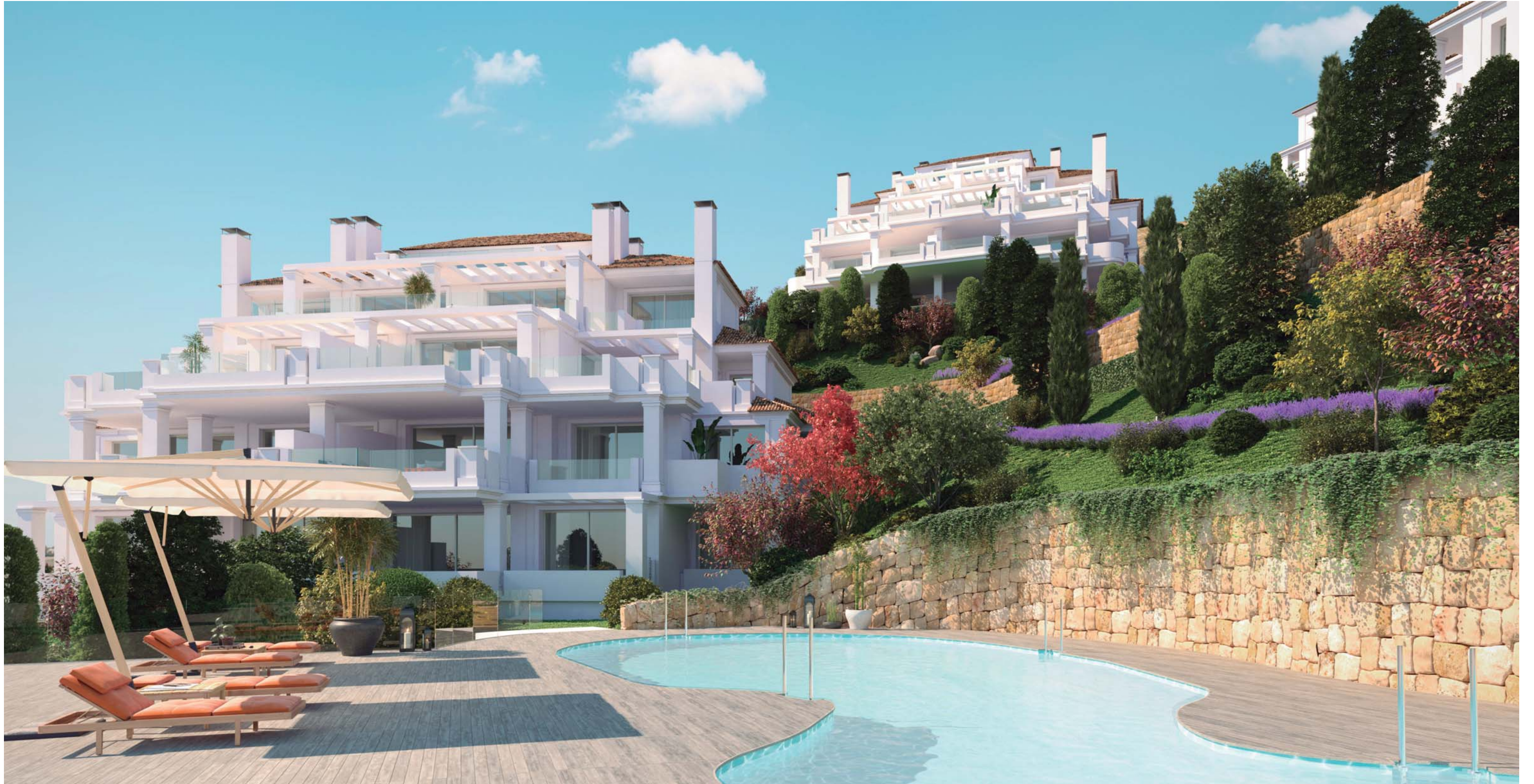
TWO SPACIOUS OUTDOOR POOLS - THE PERFECT SPOT TO ENJOY THE MANY SUNNY DAYS