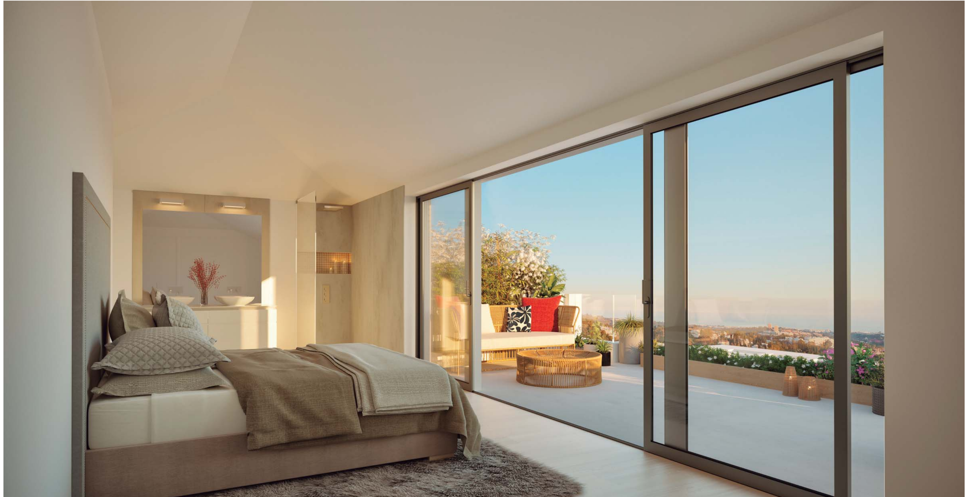
PEACEFUL EVENINGS ON THE TERRACES OF THE MASTER BEDROOMS