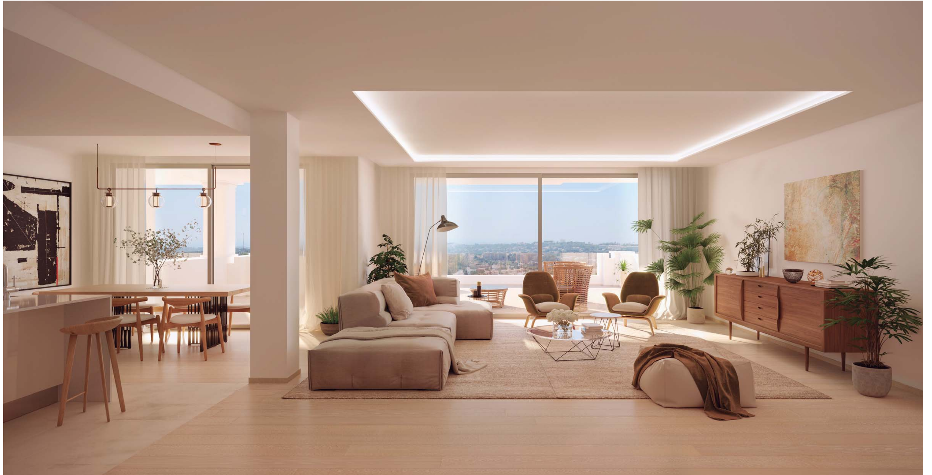
WARM, BRIGHT INTERIORS WITH STUNNING VIEWS