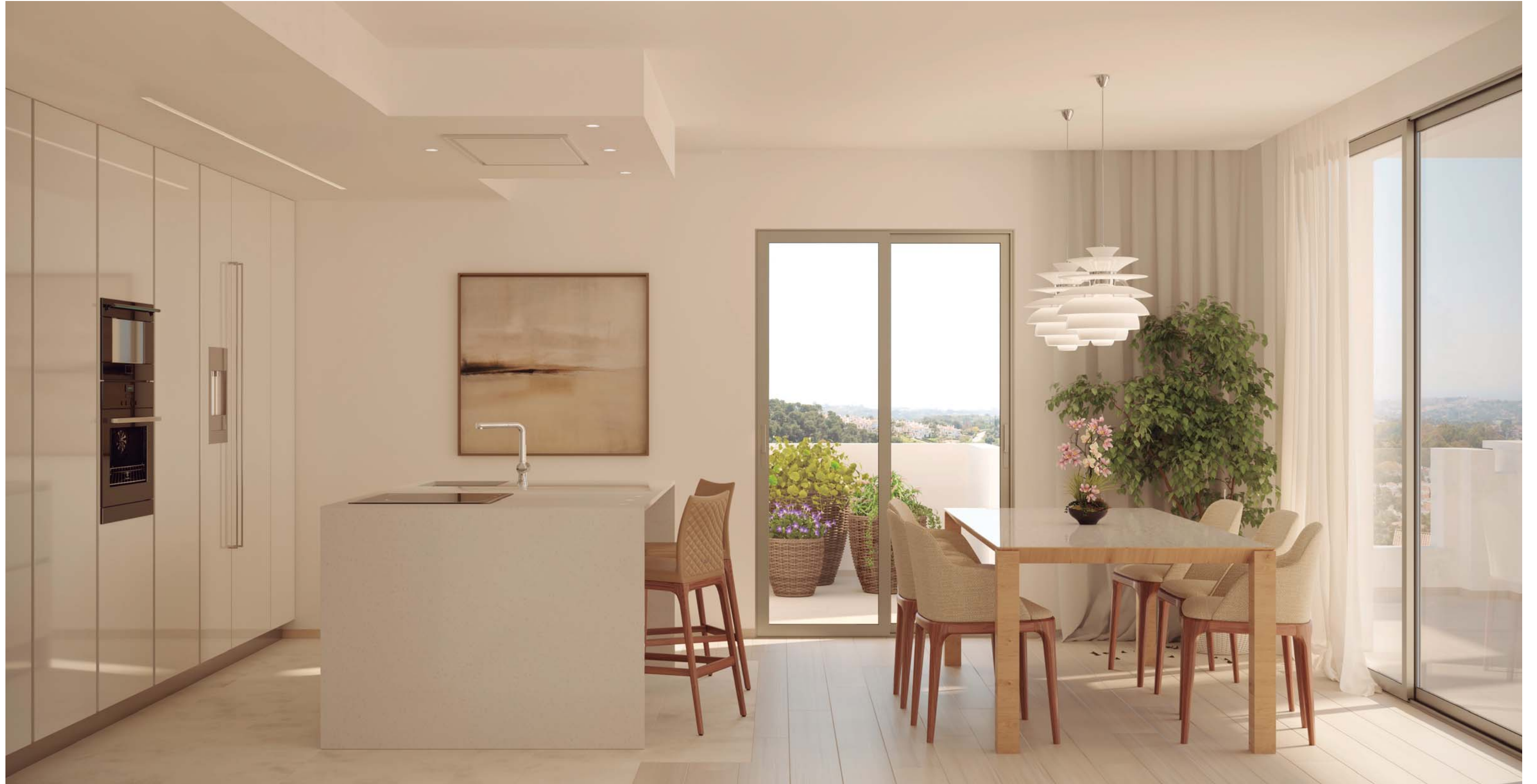
MODERN, MINIMALISTIC AND OPEN PLAN KITCHENS