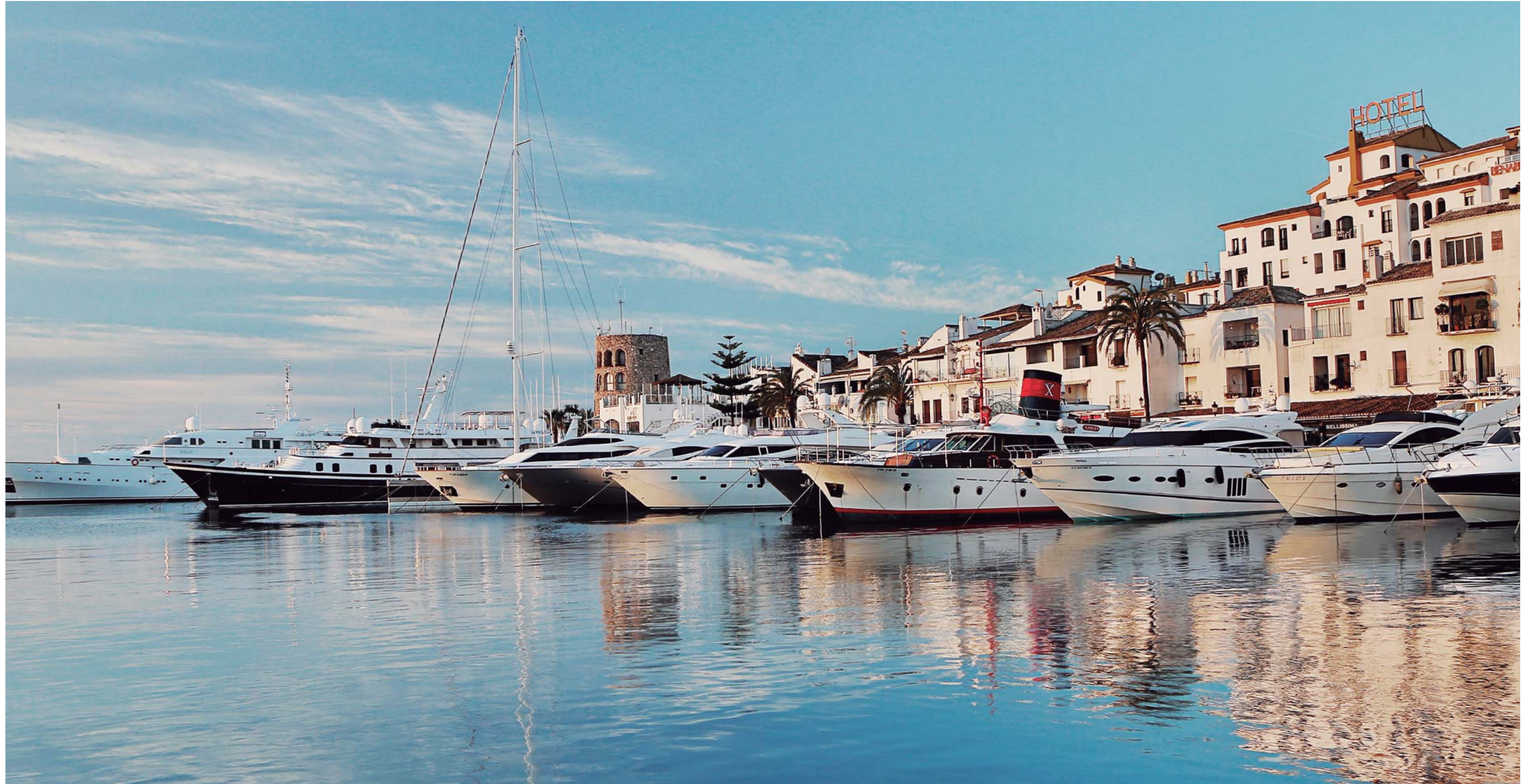
THE LIVELY WATERFRONT OF PUERTO BANÚS