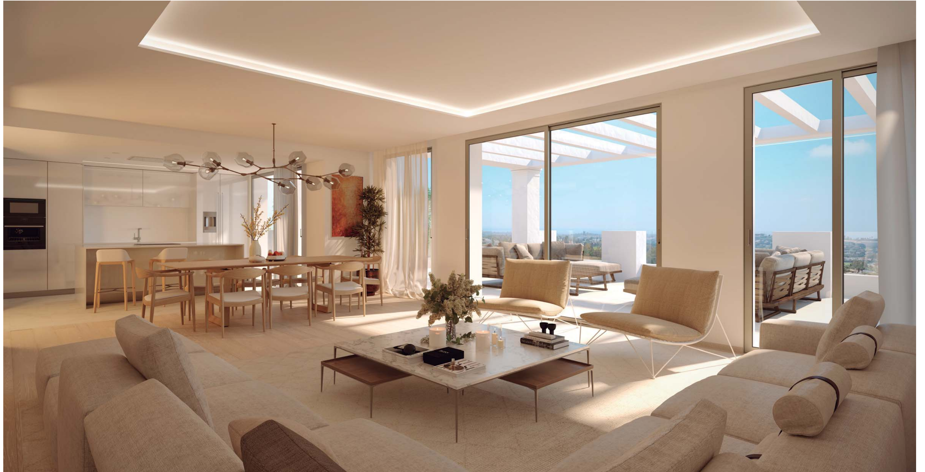
OPEN PLAN LIVING AND DINING CONCEPTS THAT SPILL OUT ONTO PARTIALLY SHADED TERRACES