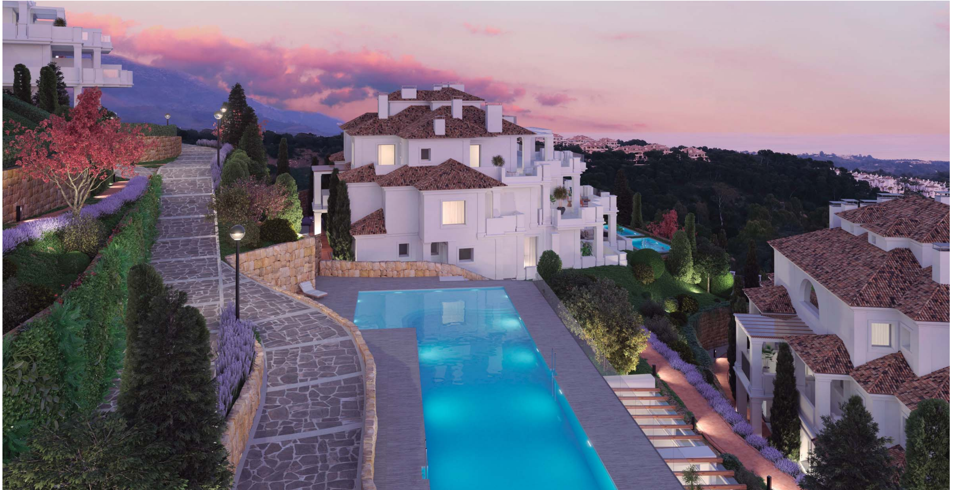
WATCH THE SUNSET FROM ONE OF THE TWO COMMUNAL OUTDOOR SWIMMING POOLS